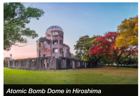
Atomic Bomb Dome in Hiroshima

Transfer to the airport for your flight back home.