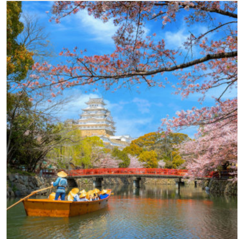
Boat tour during full bloom cherry blossom

C elebrate the breathtaking beauty of Japan's cherry blossoms on this 12-day tour through the Land of the Rising Sun. Explore Tokyo's vibrant cityscape, relax in the tranquil landscapes of Hakone, and immerse yourself in Nagoya's rich heritage. Reflect on history in Hiroshima and experience the lively spirit of Osaka Prefecture. With the cherry blossoms in full bloom, this journey offers an unforgettable blend of nature, culture, and tradition.