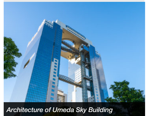
Architecture of Umeda Sky Building