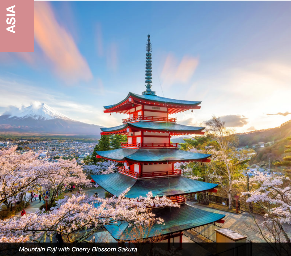
Mountain Fuji with Cherry Blossom Sakura

C elebrate the breathtaking beauty of Japan's cherry blossoms on this 12-day tour through the Land of the Rising Sun. Explore Tokyo's vibrant cityscape, relax in the tranquil landscapes of Hakone, and immerse yourself in Nagoya's rich heritage. Reflect on history in Hiroshima and experience the lively spirit of Osaka Prefecture. With the cherry blossoms in full bloom, this journey offers an unforgettable blend of nature, culture, and tradition.