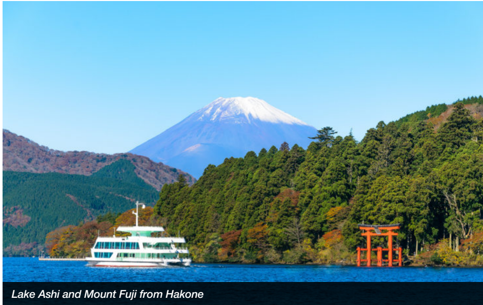
Lake Ashi and Mount Fuji from Hakone