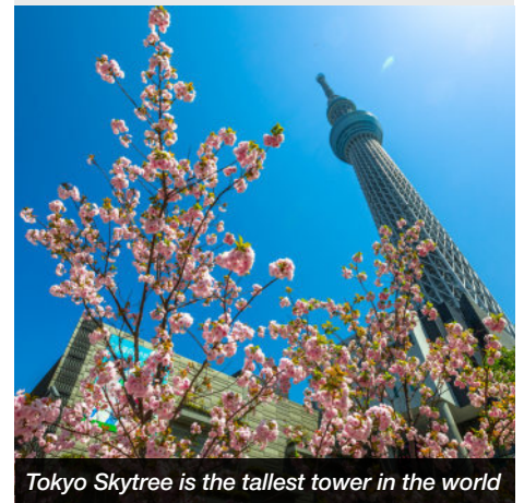
Tokyo Skytree is the tallest tower in the world