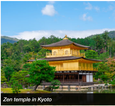
Zen temple in Kyoto