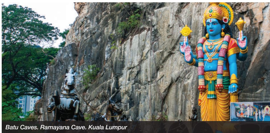
Batu Caves. Ramayana Cave. Kuala Lumpur