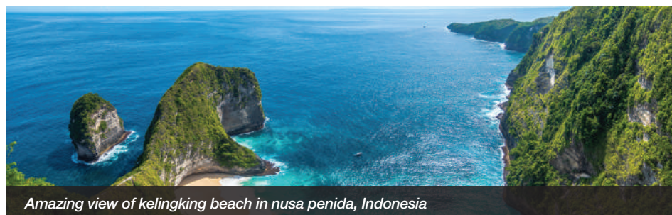
Amazing view of kelingking beach in nusa penida, Indonesia