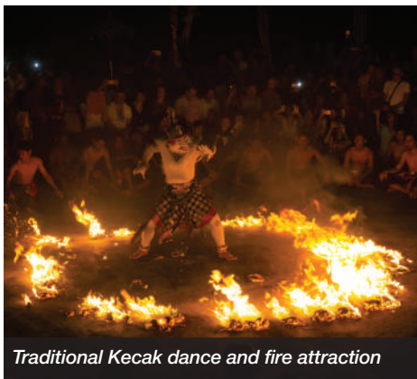
Traditional Kecak dance and fire attraction