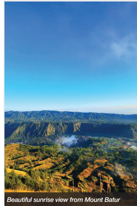
Beautiful sunrise view from Mount Batur