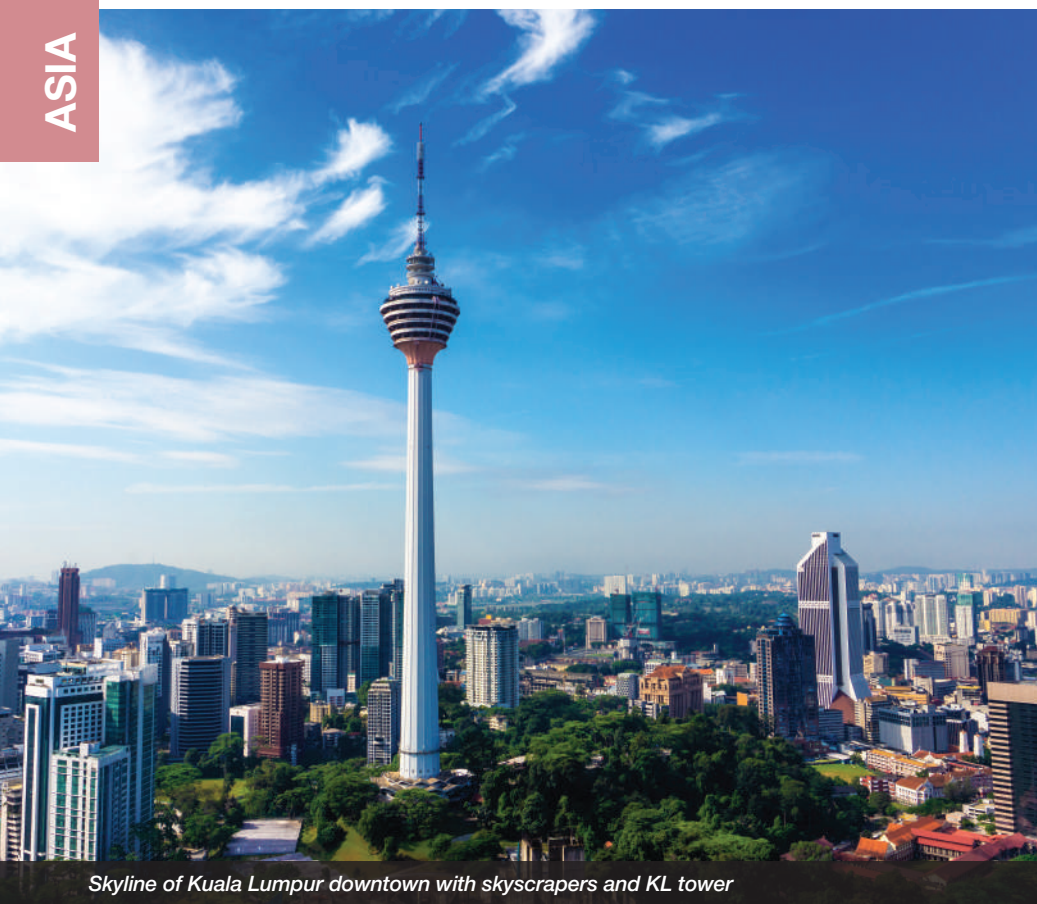
Skyline of Kuala Lumpur downtown with skyscrapers and KL tower

E mbark on an unforgettable journey through the vibrant cityscapes of Kuala Lumpur and the enchanting beauty of Bali. This carefully crafted tour blends cultural discovery, scenic landscapes, and tropical relaxation. From the modern skyline of Malaysia's capital to the serene temples and pristine beaches of Bali, experience iconic landmarks, spiritual sanctuaries, rich traditions, and island adventures – all in one extraordinary holiday. Whether it's the thrill of Genting Highlands, the mystical charm of Uluwatu, or the breathtaking views of Nusa Penida, this tour promises memories that will last a lifetime.