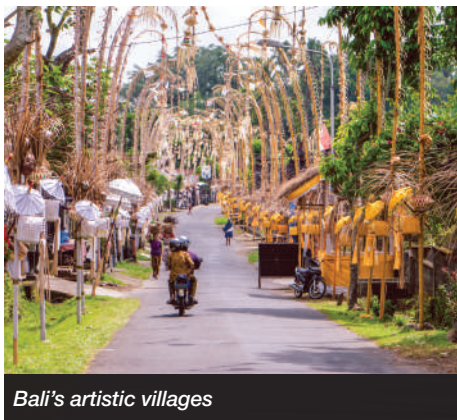
Bali's artistic villages