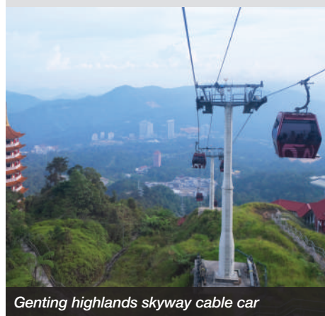
Genting highlands skyway cable car

E mbark on an unforgettable journey through the vibrant cityscapes of Kuala Lumpur and the enchanting beauty of Bali. This carefully crafted tour blends cultural discovery, scenic landscapes, and tropical relaxation. From the modern skyline of Malaysia's capital to the serene temples and pristine beaches of Bali, experience iconic landmarks, spiritual sanctuaries, rich traditions, and island adventures – all in one extraordinary holiday. Whether it's the thrill of Genting Highlands, the mystical charm of Uluwatu, or the breathtaking views of Nusa Penida, this tour promises memories that will last a lifetime.