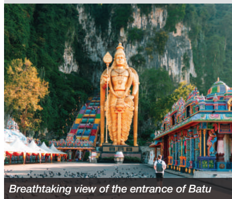
Breathtaking view of the entrance of Batu