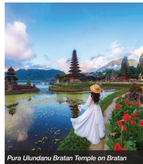
Pura Ulundanu Bratan Temple on Bratan

Transfer to Bali Airport for your return flight to London.