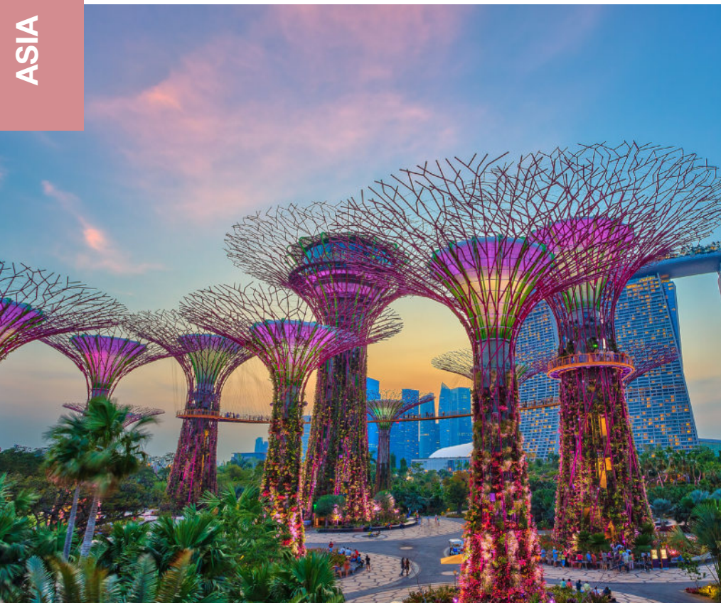
Gardens by the Bay, Singapore

E mbark on a thrilling 14-day adventure through Singapore, Malaysia, and Thailand, where diverse cultures, stunning landscapes, and vibrant cities await. Begin in Singapore, a modern metropolis with lush gardens and iconic landmarks. Explore Malaysia's rich heritage, from bustling markets to serene beaches, before immersing yourself in Thailand's ancient temples, bustling markets, and tropical beauty. This tour offers the perfect blend of exploration, relaxation, and unforgettable cultural experiences across three fascinating destinations.