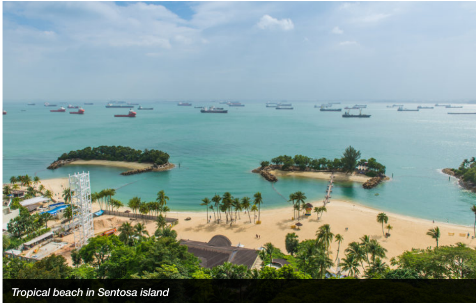
Tropical beach in Sentosa island