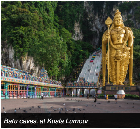
Batu caves, at Kuala Lumpur