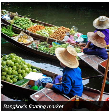
Bangkok's floating market