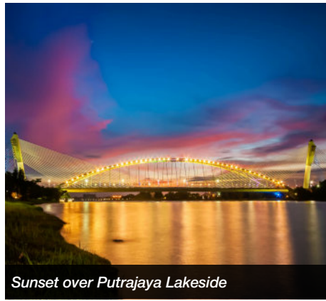
Sunset over Putrajaya Lakeside