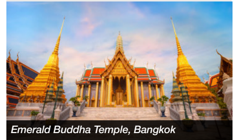
Emerald Buddha Temple, Bangkok