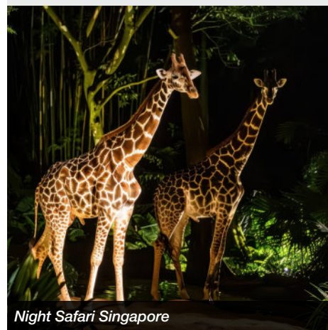
Night Safari Singapore