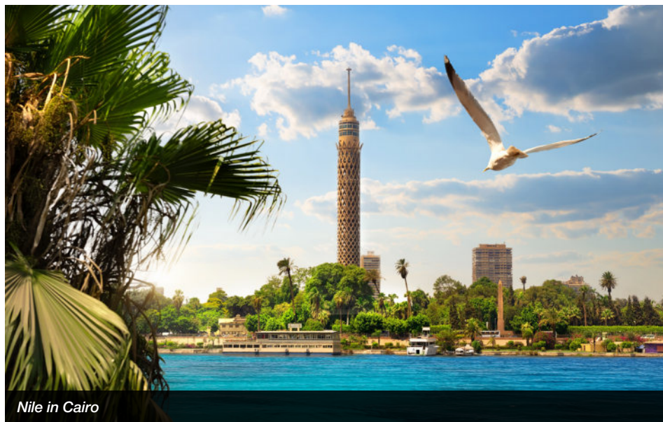
Nile in Cairo