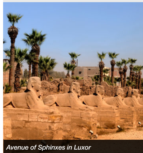
Avenue of Sphinxes in Luxor