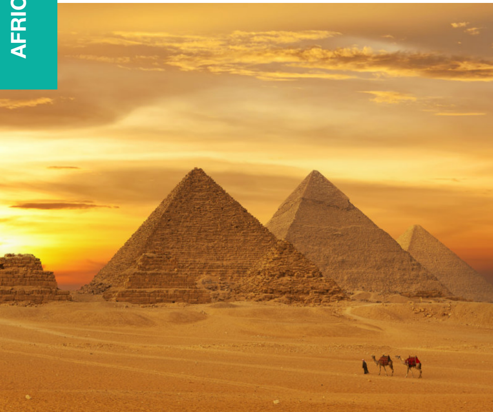
Egyptian pyramids in Giza

S tep back in time with an 8-day Egypt and Nile Cruise tour, where ancient wonders come to life. Explore Cairo's iconic pyramids and the Sphinx, then embark on a luxurious Nile cruise, taking you through the timeless beauty of Aswan and Luxor. Discover the treasures of the Valley of the Kings, majestic temples, and vibrant local culture. This unforgettable journey unveils Egypt's rich heritage and mesmerizing landscapes, a true adventure through history.