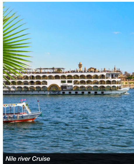
Nile river Cruise

After a refreshing stay, bid farewell to Egypt as you transfer to the airport to catch your flight back to London.