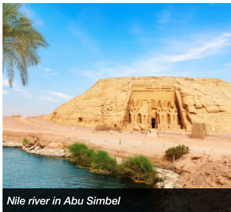
Nile river in Abu Simbel