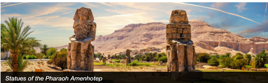
Statues of the Pharaoh Amenhotep