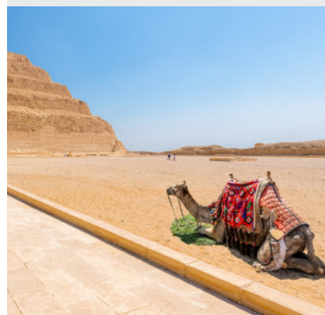
Panoramic view of town of Erfoud

S tep back in time with an 8-day Egypt and Nile Cruise tour, where ancient wonders come to life. Explore Cairo's iconic pyramids and the Sphinx, then embark on a luxurious Nile cruise, taking you through the timeless beauty of Aswan and Luxor. Discover the treasures of the Valley of the Kings, majestic temples, and vibrant local culture. This unforgettable journey unveils Egypt's rich heritage and mesmerizing landscapes, a true adventure through history.