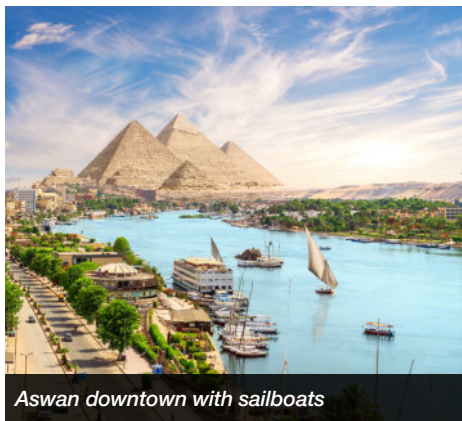
Aswan downtown with sailboats